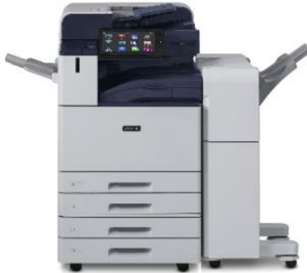
Xerox C8135 –(EDC) 35 PPM Color MFP w/Office Finisher, Hole Punch and Fax