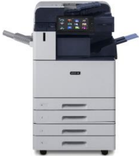
Xerox C8135 – 35 PPM Color MFP w/Integrated Finisher and Fax