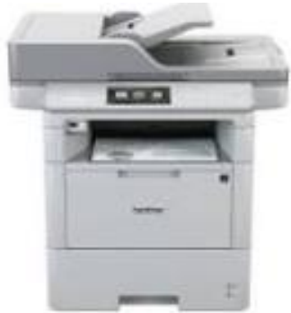
Brother MFC-L6900dw– BW Desktop MFP