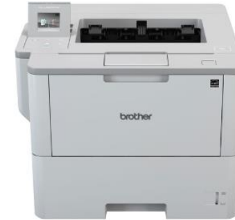
Brother HL-L6400DW– BW Desktop Printer